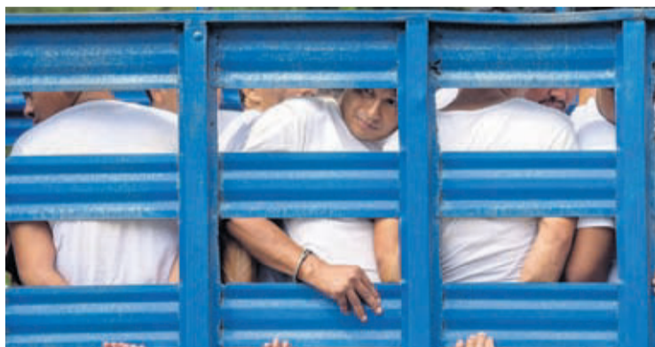
Men detained under a state of emergency are transported to a detention center in a cargo truck, in Soyapango, El Salvador, Friday, Oct. 7, 2022.

The walls of one room are covered with the texts of hundreds of laws discriminating against Jews enacted by the German occupiers of the Netherlands, to show how the Nazi regime, assisted by Dutch civil servants, dehumanized Jews ahead of operations to round them up. The museum brings to life the stories of people who were "isolated from the rest of Dutch society, robbed of their rights, denied legal protection, rounded up, imprisoned, separated from their loved ones and murdered," the Dutch king said. □